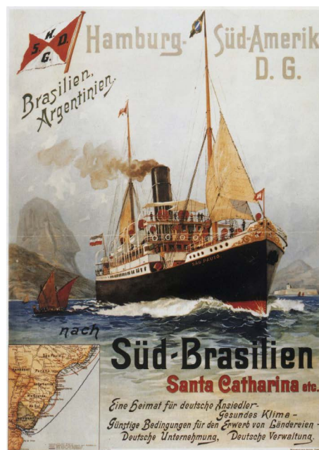
An advertisement for a transatlantic shipping company. 3

These lines were composed around 1825, at the beginning of the German immigration wave to Brazil, in order to pay tribute to the kindness of Brazil's emperor, Dom Pedro I, for offering a helping, father-like hand to the Germans, who fled a country ripe with treachery, consumed by misery, and where absolute desperation ruled. The Song of Brazil, or "Das Brasilienlied," reveals not only the social and economic constraints to which the German settlers were submitted, but also the image Brazil had in Central Europe—a result of imperial propaganda, which sought to attract European immigrants, at the same time it concealed the terrible grievances of Black slavery. Black and Indigenous people, already tortured, raped, and brutally killed by the country's financial elite, were systematically excluded from public policies as well. The project of social whitening was more successful in some Brazilian states, particularly in the south of the country, where a milder climate and a nature more similar to Europe's presented strong appealing elements.