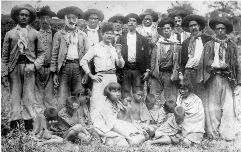
Bugreiros with Xokleng women and children 5

homes, and drove their mothers to despair is one more moral punishment for being an Amerindian in Brazil.